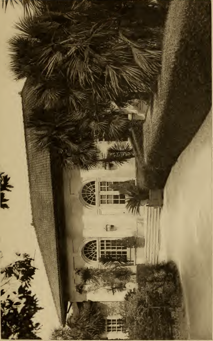
COTTAGE OF EDWIN GOULD